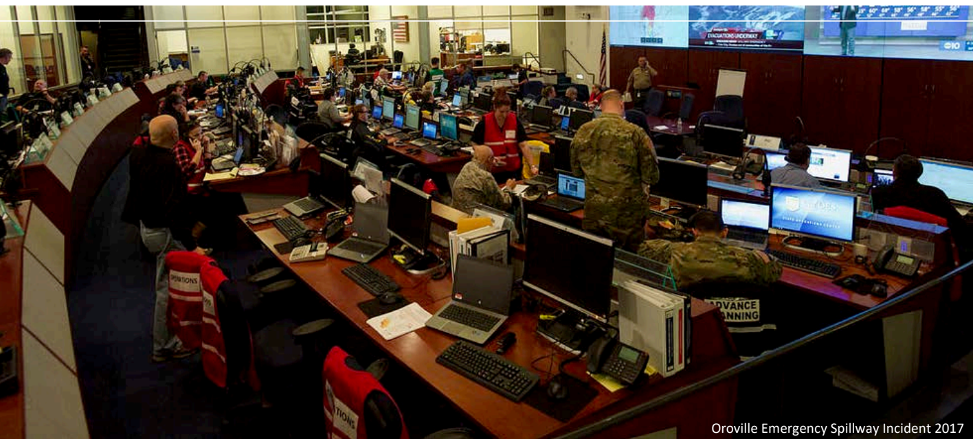
Oroville Emergency Spillway Incident 2017