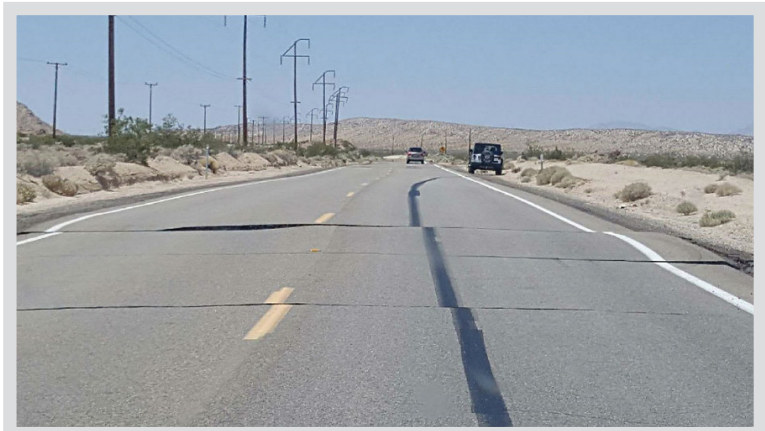
A road was heavily damaged in Ridgecrest due to the earthquake on the 4th of July. https://spec-trumnews1.com/ca/la-west/news/2019/07/08/earthquake-economic-losses-estimated-at-1-billion- (accessed July 27, 2020)