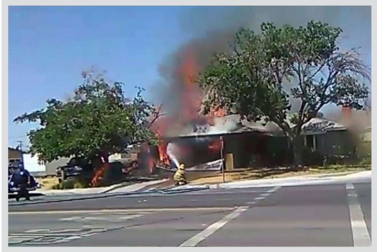
In this image taken from video provided by Ben Hood, a firefighter works to extinguish a fire, Thursday, July 4, 2019, following an earthquake in Ridgecrest, Calif. Ben Hood via AP. https://abcnews.go.com/US/earthquake-preliminary-66-magnitude-rocks-southern-california/story?id=64135583 (accessed July 27, 2020)

There is another measurement of an earthquake known as intensity . Intensity is the amount of shaking that is felt by humans on the surface of the earth at a particular spot during an earthquake . After an earthquake , people who experienced movement can report what they felt, and scientists will use that data to create an intensity map like the one for the Ridgecrest Earthquake on the following page. This map was created by the contribution of