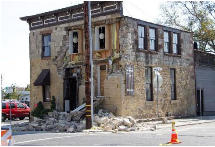
Figure 4. Image of damaged two-story building.

All proposed projects which may affect historic properties must be reviewed by FEMA and the State Historic Preservation Officer (SHPO). A historic property is any prehistoric or historic building, site, district, structure, or object significant in American or State history, architecture, archaeology, engineering, or culture.