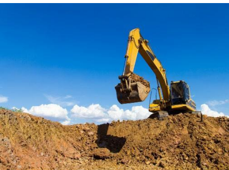
Figure 6. Image of bulldozer removing soil from a pit.

Any project involving ground disturbance outside the previously disturbed footprint, even if within an existing right-of-way (e.g., facility relocation, material borrowing, utility pole or fence replacement, and access road construction), may require archaeological and DOH review.