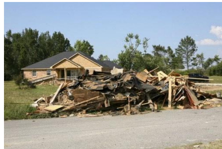
Figure 5. Image of debris staged on the side of the road.

No FEMA or disaster-specific contacts, approvals, or permits are required to collect, haul, or transfer solid waste debris to a licensed landfill.