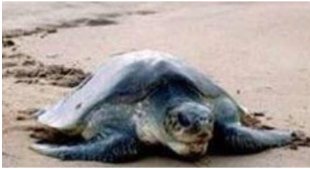
Figure 2. Image of sea turtle on beach sand.

The Clean Water Act (CWA) applies to actions affecting “waters of the United States”. This includes any part of a surface water system: natural waters including oceans, seas, bays, lagoons, streams, lakes, and wetlands; as well as isolated human-made waters. The U.S. Army Corps of Engineers (USACE) and CA State Water Resources Board (Water Board) administer this law.