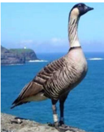
Figure 3. Image of goose on a rock.

Under the Endangered Species Act (ESA), for any project that has the potential to affect Federally threatened or endangered species or their habitats, FEMA must consult with the U.S. Fish and Wildlife Service (USFWS) or National Marine Fisheries Service (NMFS). Typically, this process results in the development of measures to avoid or minimize impacts to such species or habitats.